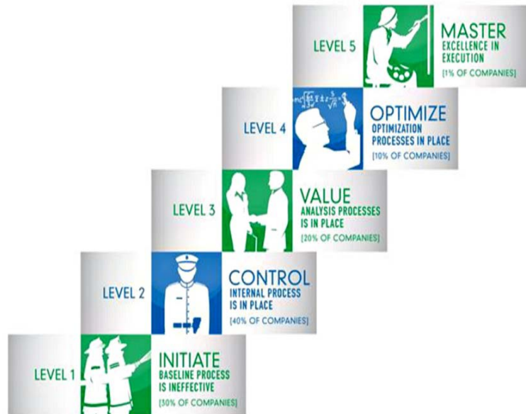
Figure 1: World Class Pricing Process Maturity

This article will describe each level, and summarize the role of the pricing manager and the key process benchmarks for determining whether a company has achieved a particular level of competency